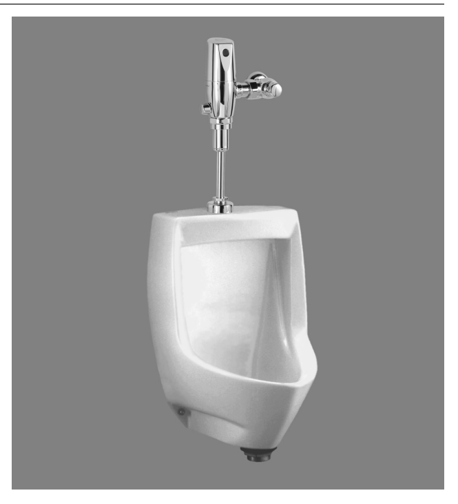
SEE REVERSE FOR ROUGHING-IN DIMENSIONS

ASME A112.19.2/CSA B45.1 for Vitreous China Fixtures