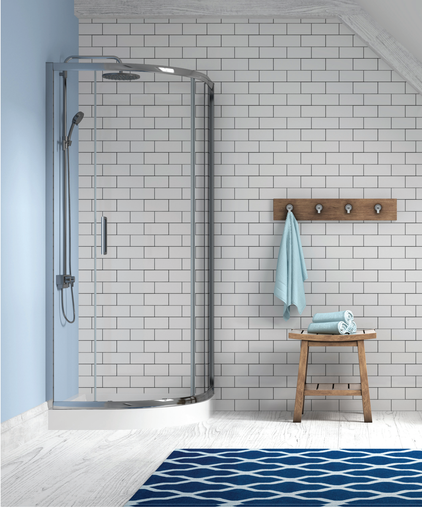
Acri-tec Industries Corp.