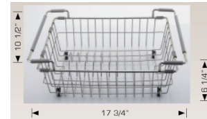
Plate Holder Model: 202041