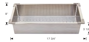
Colander Model: 202040