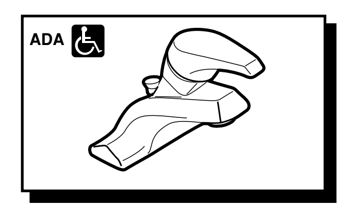
CHATEAU® Single-Handle Lavatory Faucet with Metal/Polypropylene Waste Assembly

Model: L64621, L64621P, L64621W Bulk Packed (12 per carton)