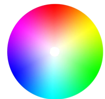
LED Mood Lighting & Separate Control